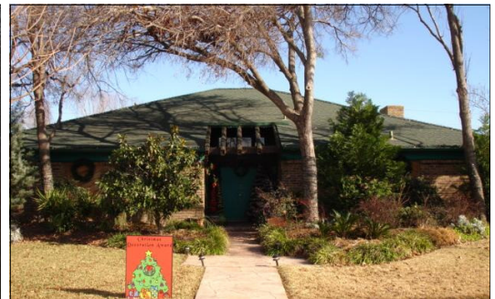
Patricia Campbell 653 Goodwin