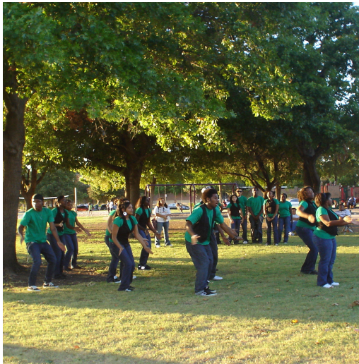
Berkner HS Hip-Hop Stomp Team