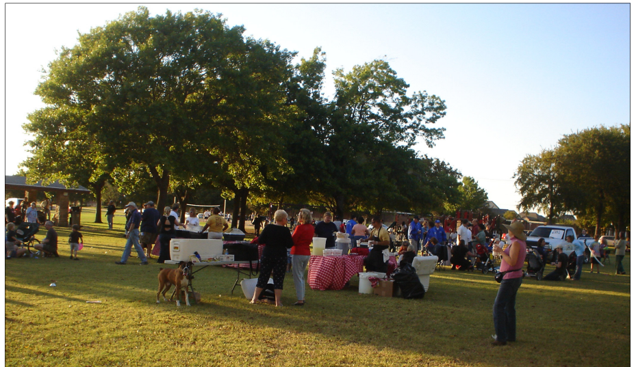
October's National Night Out/Festival was a hit for all ages. See more on pg. 4.

Fall 2008 General Membership Meeting Thursday, Nov. 13, 2008 6:00 p.m. Richland Elementary Cafeteria