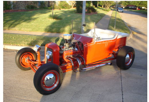
One of the custom cars on display