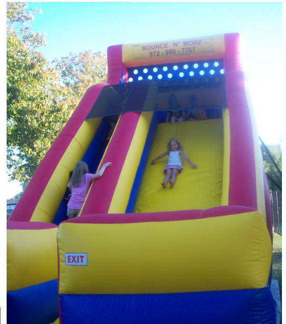
Bounce houses were a big hit