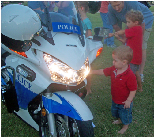
Richardson Police motorcycle display

Combining crime watch event with a neighborhood festival brings out the crowds