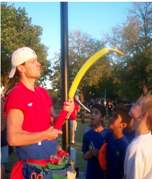
Free balloon animals for the kids