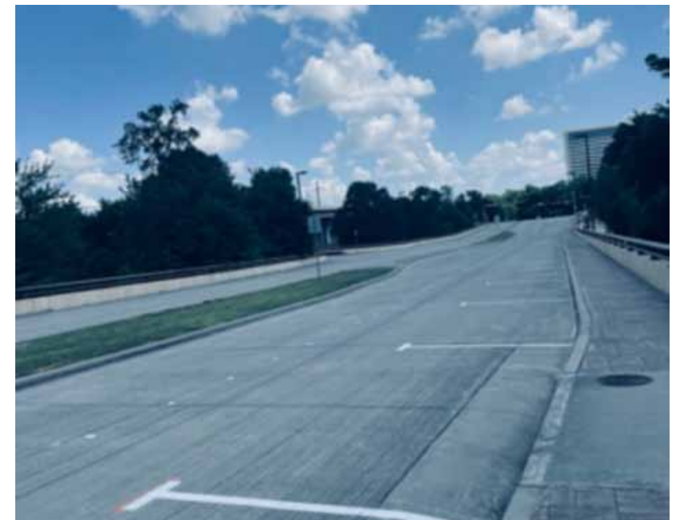
New parking spaces on Routh Creek Parkway.