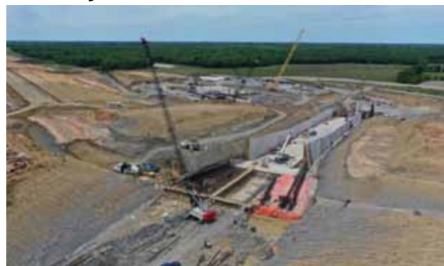
Work is underway on the nearly 1,000-foot-long spillway, which will release water back into Bois d'Arc Creek.

In addition to work on the actual lake infrastructure, workers are improving or constructing 11 miles of roads around the lake. Improvements are also being made to more than 17,000 acres to mitigate for loss of habitat and impacts to local streams from construction of the lake. Workers continue to restore streams, maintain ponds, care for new plants and remove invasive species. Work on three public boat ramps, parking lots and related recreational facilities is