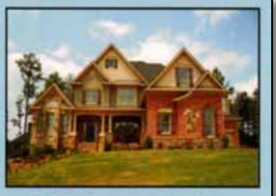
Quality Inspections for 25 Years

1230 Whispering Oaks Lane, Richardson, TX 75081